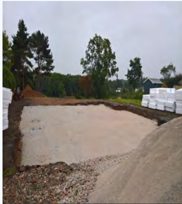
STEP 1: Clear the topsoil, take levels and lay compacted hardcore 150mm deep. Radium sump and pipework are laid at this stage.