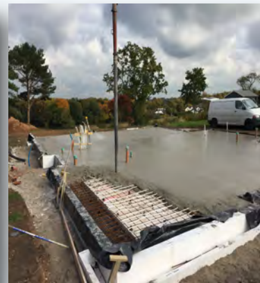
STEP 6: Insulated foundation system is now complete and ready to take 100mm concrete.