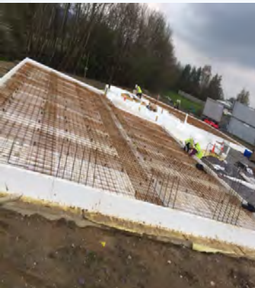
STEP 5: Install steel through the ring beam profiles and place steel mesh reinforcement according to our structural engineer's design. (Supplied).