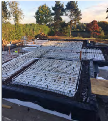
STEP 4: Place three layers of floor insulation sheets over the remaining foundation. Overlap sheets to achieve continuity of insulation. Secure with pins provided.