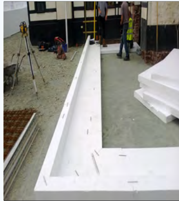
STEP 2: Place corners in position and set level.