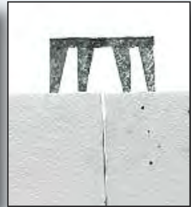
STEP 3: Continue placement of ring beam profiles. Trim profiles as necessary to achieve a tight fit.